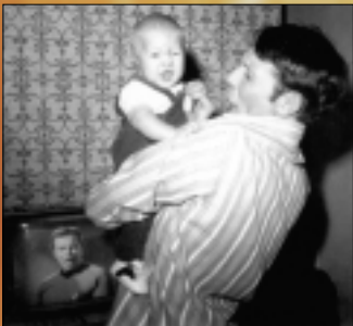
The author, the cover artist, and a noted starship captain grince in unison, thirty-odd years ago.